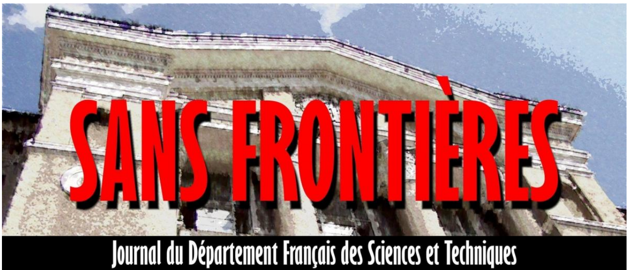
The logo of the newspaper «Sans Frontières» in French

The September issue of the newspaper «Sans Frontières» in French that had shown itself to good advantage came out. We are bringing to your attention one of its articles.