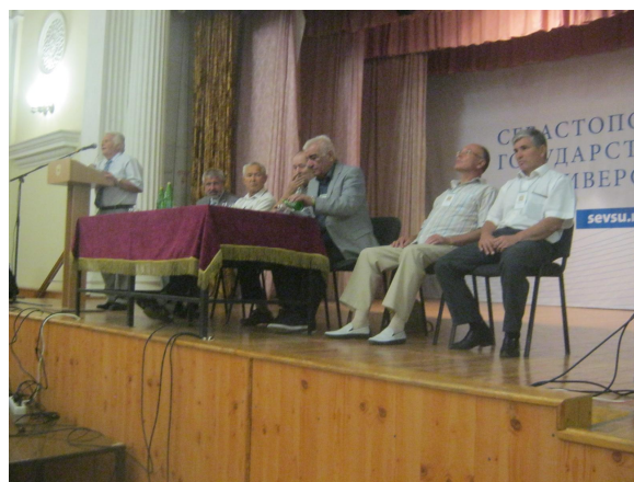
The Panel (the DPR, the LPR and Armenia)

The annual international scientific and technical conference is traditionally held in September, on the eve of the Mechanical Engineer’s Day. The meeting of the International Union of Mechanical Engineers is organized within the frameworks of the conference. Besides, according to the recommendations of its members, the efforts of the universities of Lugansk, Donetsk, and Sevastopol were joined to hold 12 international conferences as a single forum. Researchers from Russia, Kazakhstan, Armenia, Nagorno-Karabakh, the DPR, the LPR, Belarus, Ukraine, Turkmenistan, Azerbaijan, Bulgaria and Great Britain also took part in the