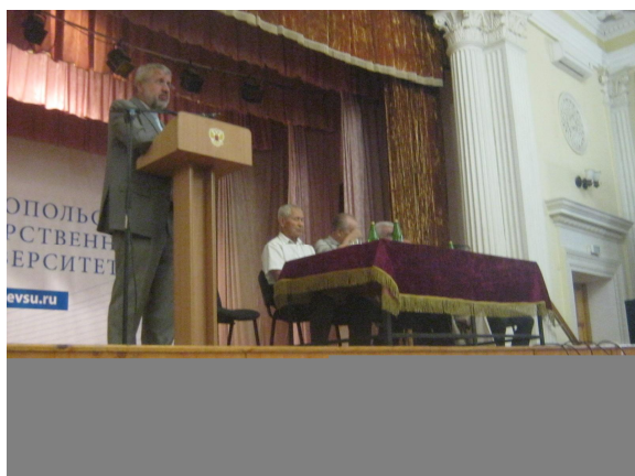
The opening of the conference

current problems. This allows saying with good reason that science and progress will be continuously developed and become more active. Participation of different universities developed promising links and formed traditions of discussion of topical problems. The forum also consolidated researchers, experts and industrial