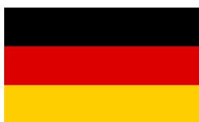
Flag of the FRG