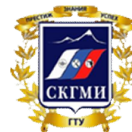
The University logo

2. The collaboration agreement was signed by DonNTU and North Caucasus Mining and Metallurgical Institute. Thus the institutions found team-mates to develop academic, methodological, research, pedagogic and cultural activity. The agreement is with no fixed term.